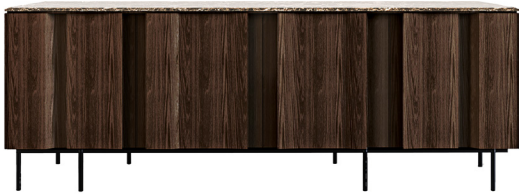
BRYANT | SIDEBOARD