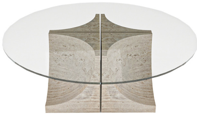
EDGE | CENTER TABLE