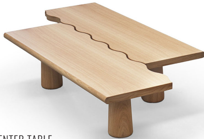
LOONGA | CENTER TABLE