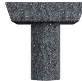
TOTEM SIDE | CENTER TABLE