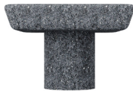
TOTEM II | CENTER TABLE